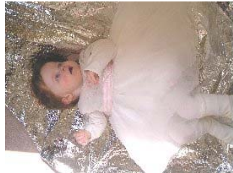
Bella and her space blanket

One website I found it at is http://www.amazon.com/Carlen-Enterprises-Musini-MagicSensor/dp/B000065CKT